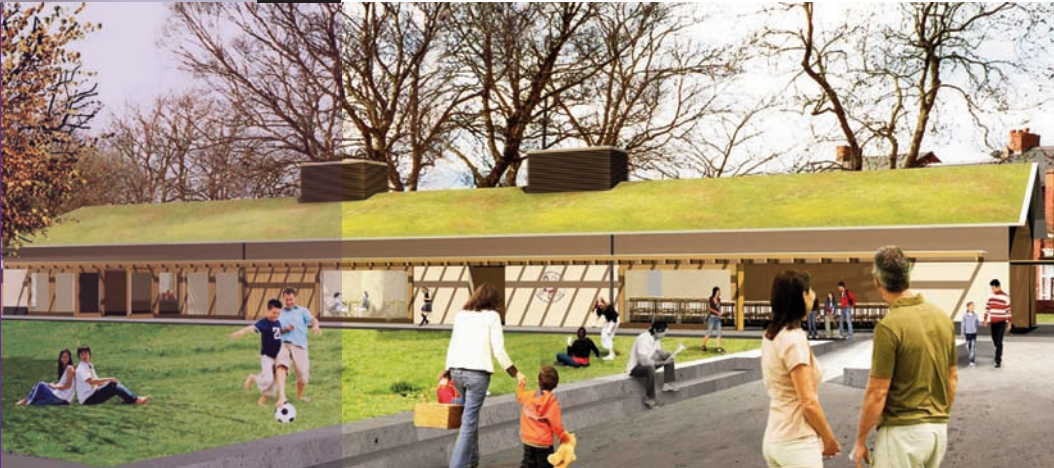
Image: Plans for the 4 C community centre, in Ashton