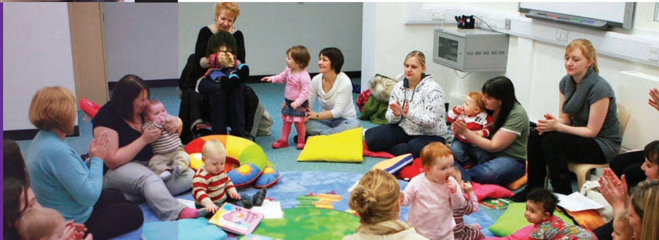
Image: Children Centre, Droylsden

Tameside 3rd Sector Coalition helps to keep Tameside's children safe through our Children and Young People Networker.