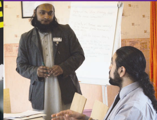
Image: GMP and T3SC recruitment event

DRUGS | DIVERSITY | PARENTING ACHIEVING A DRUGS FREE HEALTHY LIFESTYLE