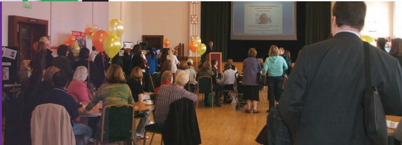
Image: TASCA conference for World Autism Day